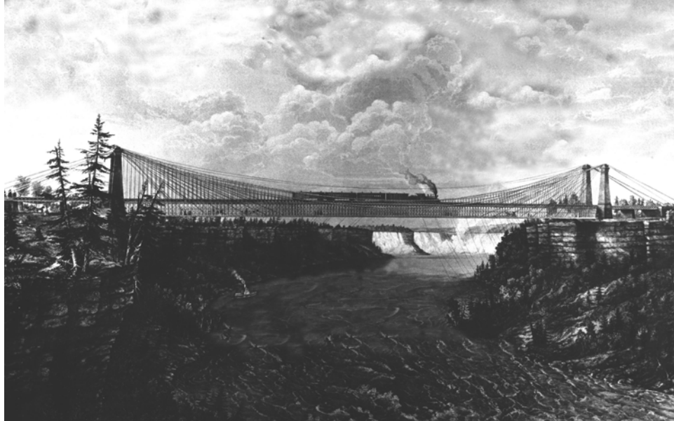
FIGURE 2 JOHN ROEBLING'S RAILWAY SUSPENSION BRIDGE AT NIAGARA FALLS, NY – 1854