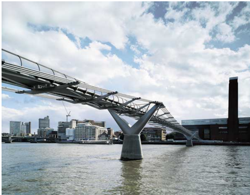
FIGURE 1 THE MILLENNIUM BRIDGE

The phenomena of forced harmonic excitation of bridge structures is well understood, and has been well documented by many sources. Most military manuals dating back well into the 1800’s have warnings about soldiers marching in step over bridges of any type. This was true even for substantial bridges. For example, in 1860 the famous 1854 Roebling two-deck railway suspension bridge across the Niagara River at Niagara Falls, NY USA was posted with a warning notice to pedestrians against walking in-step. This heavily built, record-setting span is depicted in Figure 2, from an 1850’s engraving. The warning notice, reproduced from period photographs, is shown in Figure 3.