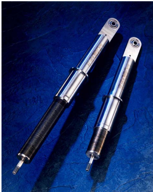
FIGURE 4 SPACE SATELLITE DAMPER

To adapt this basic design to the Millennium Bridge largely involved simply scaling the small satellite dampers to the required size range. All parts, including the metal bellows, were designed with low stress levels to provide an endurance life in excess of 2 \times 10^9 cycles. The metal bellows and other moving parts were constructed from stainless steel for corrosion resistance.