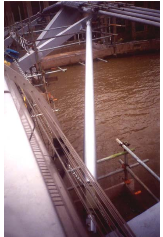
FIGURE 8 PIER DAMPERS