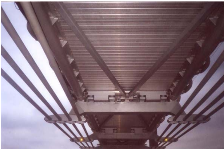
FIGURE 9 CHEVRON DAMPER

The third and final series took place on January 30, 2002, with a total of 2,000 people. The test began at 6:00 P.M., using office workers exiting from businesses near the bridge as test subjects. Crowd control was maintained by stationing the test subjects within fenced compounds at each end of the bridge, and furnishing food and beverages.