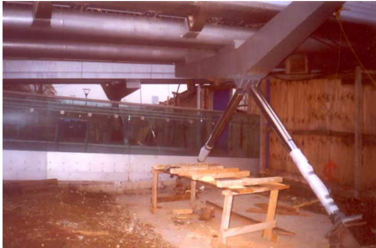
FIGURE 7 VERTICAL DAMPERS